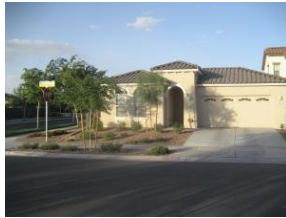
4134 Waterman Court,

Comments: New flooring, paint, and more. Vacant, clean, and move-in ready for your family. Power ranch is a "way of life" with schools, rec centers, and pools on site. Master and additional 2nd bedroom are on the main floor, and 3 more bedrooms, plus a loft up-this great floor plan suits many family situations with 3 full baths, and large bedrooms. Arches, multiple tall ceiling heights, neutral colors, fireplace, niches, and so much more. 3 car garage. Back yard is nicely