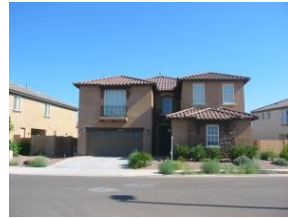
4648 Waterman Court,

Comments: Beautiful home located in the heart of power ranch. Very clean 2 bed 2 bath richmond american home with upgraded tile, neutral accent paint, great room, eat in kitchen and large master suite. Within walking distance to community center, walking trail, lake, and brand new elementary school. A two car garage completes this great package.