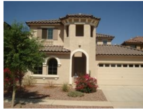
3922 Claxton Avenue,

Comments: Close fast!!!!Beautiful home in fantastic neighborhood. Plenty of tile all, and a great open floor plan. The yard is huge and perfect for entertaining and relaxing. You must see this one.