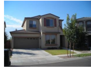
4223 Santa Fe Lane,

Comments: Lender owned in good condition, nice floorplan with laminate flooring on 1st level. Great opportunity, must see!