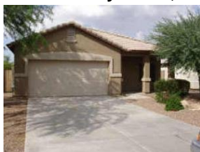
4113 Shady Court,

Comments: Buyer unable to perform. Gorgeous former t w lewis model with all the options & custom features. Power ranch was voted best master planned community by azcentral.Com. Beautiful washington cherry plank wood & tile flooring in all the right places. 4 car tandem garage. Kitchen includes upgraded maple cabinets, granite slab countertops, large island with stainless steel appliances. Family room features a fireplace & a