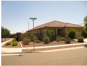
4032 Battala Avenue,