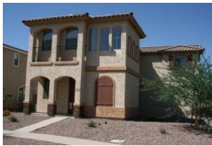
3782 Stampede Drive,