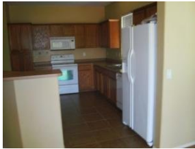
4620 Cabazon Road,

Comments: Power ranch winning master plan community with schools, parks, club houses and much more. Beautiful homes with many upgrades, best price in the area. This short sale is sold as-is, no warranties buyer(s) to verify all information. No spds or clue report.