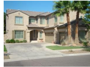
4530 Marshall Avenue,

Comments: This home is missing a whole kitchen and a bathroom! Not move in ready! 203k and cash would be the best route for this home.