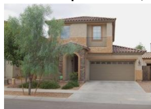
3749 Stampede Drive,

Comments: 4 bedroom 2 bath single level home with nice 9ft ceilings. Is sought after power ranch. Community includes pool, play areas hiking & jogging trails, bbq grills and a2 acre catch and release lake. Bank of america lender owned, buyer must have bank of america pre-qual if financing. Free credit report and appraisal if buyer finances through bank of america