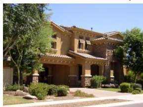
4320 Santa Fe Lane,