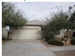
4171 Splendor Court,

Comments: Great opportunity to own in one of the best communities in gilbert. This 3 bed 2 bath home has neutral paint and tile. An open floor plan with large living areas. Master has big walk-in closet, dual sinks and a separate shower and tub. Nice sized yard with grass and close to parks and the school. Walking distance from one of the best community centers in gilbert, large pool with a lifeguard, catch and release fishing lake. Many community events and