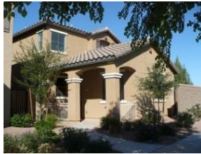
3945 Rim Road,

Comments: Lender owned, sold as/is, where is. All facts, figures and measurements to be verified by buyer, including those in the mls. Buyers must receive an lsr through wells fargo prior to submitting offer. Seller has never occupied property and is unable to provide spds or clue report. Accepted offer will be countered by seller with counter addendums and title company information.