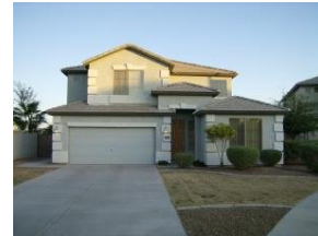
4107 Sundance Court,

Comments: Back on market.Great home in a highly desired area. Hurry! Very cute, great condition!This property is a fannie mae homethat property, purchase it for as little as 3% down! Great home in a highly desired area. Hurry!