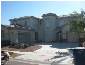
4521 Reins Road,