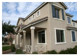
3888 Santa Fe Lane,

Comments: Lender owned special!!! Beautiful 3 bedroom home in highly desirable gilbert area. Great kitchen with breakfast bar, stainless steel appliances and dark wood cabinets. Tile throughout the downstairs and bathrooms, walk in master closet and separate shower and garden tub. Front features covered patio and courtyard with rear garage & private alley entrance. This one is move in ready! This is a fannie mae homerpath property,