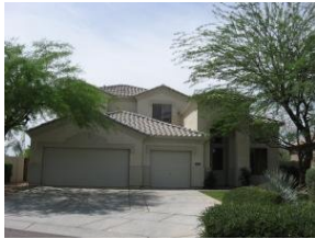
4371 Sundance Court,