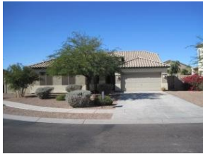
4337 Cloudburst Court,