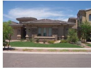
4112 Woodside Way,

Comments: Reduced on 07/21/09, 5 bedroom, 3.5 bathroom, 3 car garage, almost 4,700 square feet home in power ranch, large kitchen has double ovens and flat top surface range. Large loft at top of stairs, french doors leading into master suite, his and hers closets in master suite, lots of closets and storage throughout home. Seller is motivated to sell but can not help with any cost. On lock box and ready for your offers!!