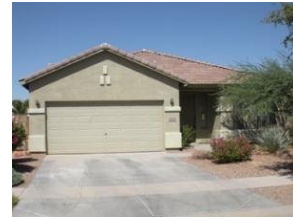
4256 Cloudburst Court,

Comments: Bank owned property. What a great home tile on first floor. Nice open floor plan. Upgraded kitchen cabinets with granite counter tops. Home has really nice features. Home sold as is. No spds or clue reports. This is a fannie mae hompath property. You can purchase this home for as little as 3% down and it is approved for the hompath mortgage financing.