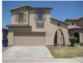
4014 Ironhorse Road,

Comments: Wonderful power ranch 4-bedroom home in the "orchards" in gilbert. Only lived in by current owner and always kept in immaculate condition! Home features 4 full bedrooms, 2 baths, large master, and a grassy backyard that backs to the greenbelt. Home is on a corner lot w/ only one neighbor to the east. Separate tub/shower in mb, tile floors in all the right places, 9' ceilings, 2-car finished garage, plus a spacious, open kitchen/family room