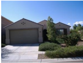
4729 Cloudburst Drive,

Comments: Beautiful cul-de-sac lot with one of standard pacific's best floorplans. Move-in condition with neutral carpet, paint and ceramic tile floors in the high traffic areas. Front door opens to spacious living room. Kitchen features plenty of oak cabinets, an island and a big pantry. Bank owned home, sold in as-is condition. Missing appliances may restrict financing options. No spds and no clue, please waive in contract. Please allow 3-5 days for seller